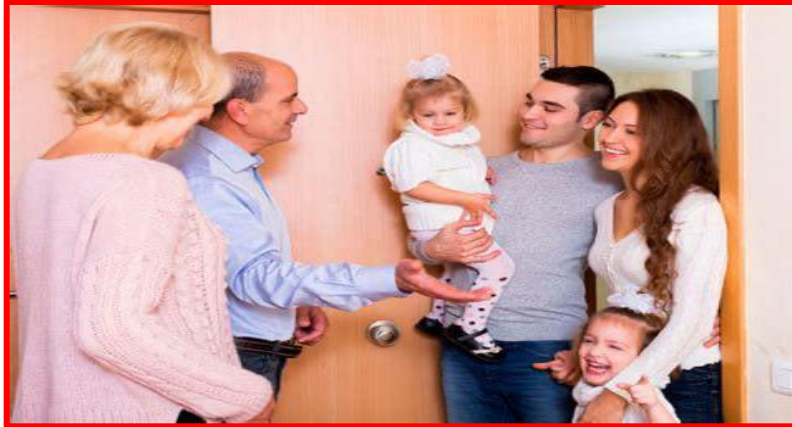
Visit friends and relatives Have a Spring Trip