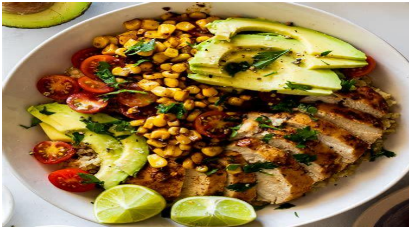
Preparing delicious food at home