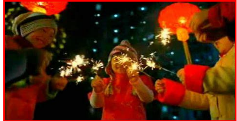
Set off fireworks Receive and send red packets