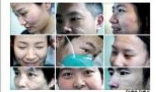
Medical workers wearing masks and safety goggles (护目镜) leave their marks on the faces of medical workers after a six-hour shift.

Masks and safety goggles (护目镜) leave their marks on the faces of medical workers after a six-hour shift. The Xiangshi branch of the No. 1 Hospital Affiliated to Nanchang University is one of Jiangxi province's designated (指定的) hospitals for treating severe novel coronavirus pneumonia cases. To save time and medical supplies, medical workers there commonly work for a long time without rest.